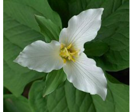
Western Trillium (Wake-Robin)

For more on landscaping for wildlife, see WDFW's webpages, starting with http://wdfw.wa.gov/wlm/backyard/landscape.htm and including WDFW's book "Landscaping for Wildlife" at http://wdfw.wa.gov/wlm/landscap.htm .