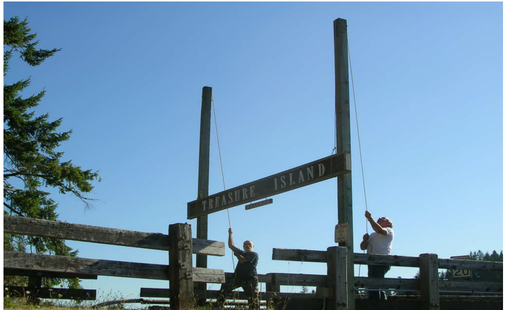
Rick Buran and Daryl Axelson Removing Bridge Sign

Signs of activity towards the approaching construction project have begun! Modifications have been made to well site #1 to accommodate what will be a wider roadway approach to the bridge (more on Page 2) and the overhead entry sign was removed. The next task will be to relocate the traffic signal further west on the mainland side to make way for the new approach.